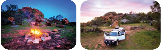
Camping at Eaglestone Rock

Campfire photo above by Kylie Gee www.indigostormphotography.com