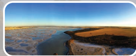
Lake Brown